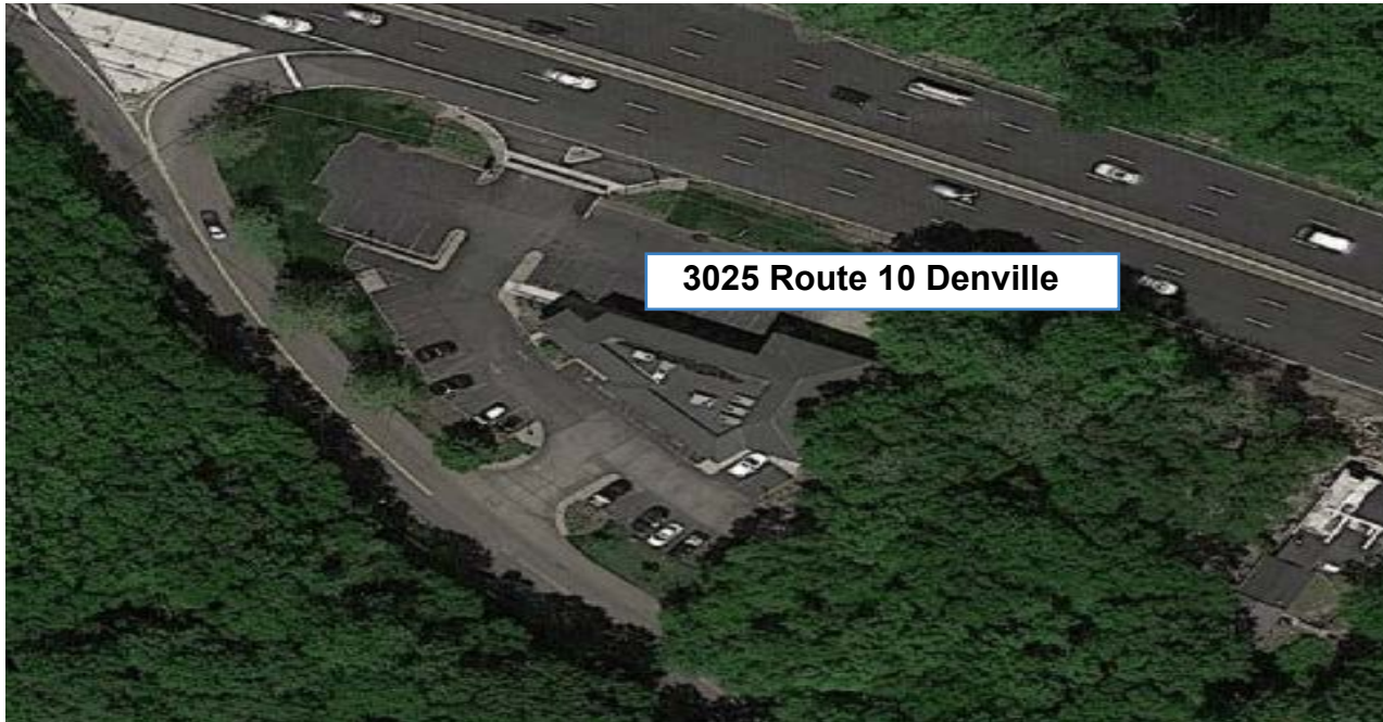
3025 Route 10 Denville