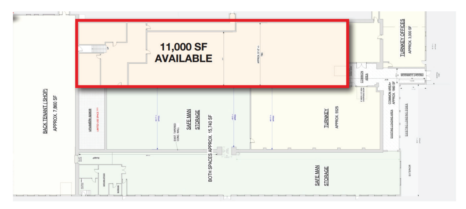
Floor Plan May Not Drawn to Scale

NewmarkRealEstate.com | 973.884.4444 | 7 E. Frederick Place Suite 500 Cedar Knolls New Jersey 07927